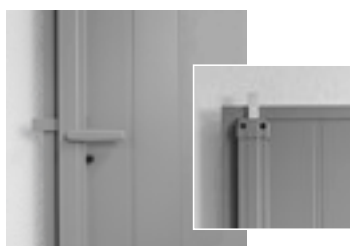
Rod lock (surface-mounted)