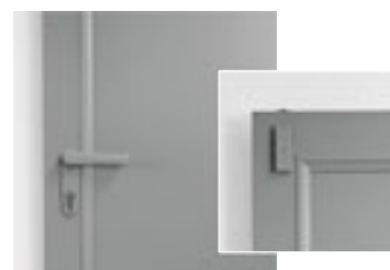
Rod lock (installed)