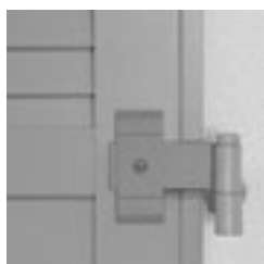
Express hinge with locking ring